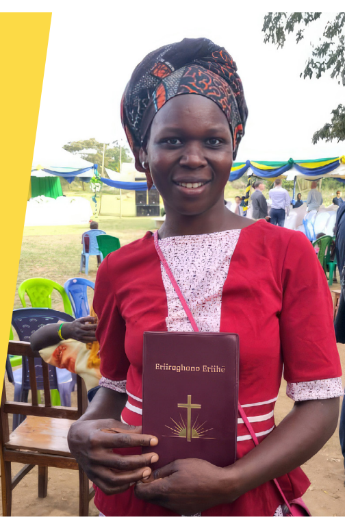
State of the Bible 2023 7

Thank you for your support for and interest in the work of Bible translation.